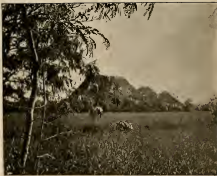
NIPA HOUSE AND RICE FIELD.